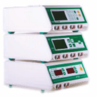
Stackable Chassis Design