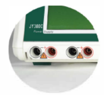
Embedded Power Jacks