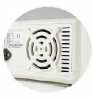
Low noise, Strong radiator Fan