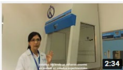
Kalstein France - Jacinto Convit Foundation / Alliances