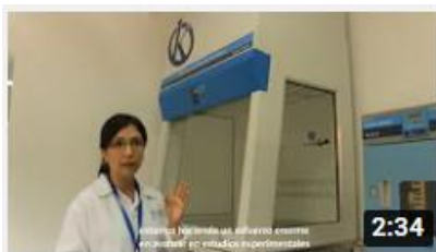
Kalstein France - Jacinto Convit Foundation / Alliances