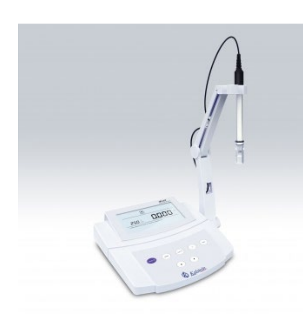
Benchtop Conductivity/TDS Meter Model YR01830