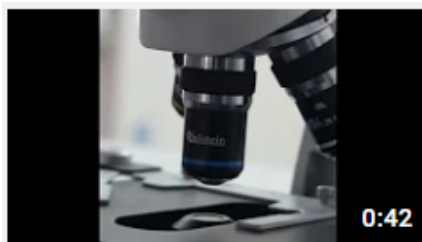
Kalstein's Microscopes 445 views • 1 week ago