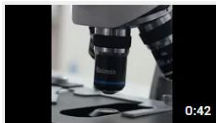
Kalstein's Microscopes 445 views • 1 week ago