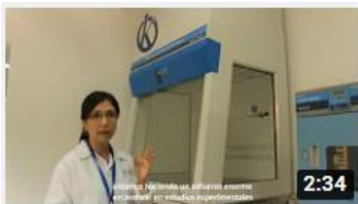
Kalstein France - Jacinto Convit Foundation / Alliances 23 views • 3 years ago