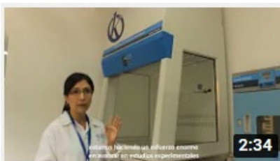
Kalstein France - Jacinto Convit Foundation / Alliances 23 views • 3 years ago