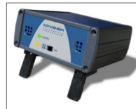
Option: static eliminator