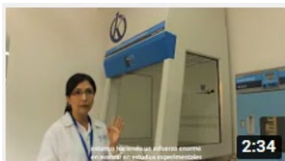
Kalstein France - Jacinto Convit Foundation / Alliances 23 views • 3 years ago