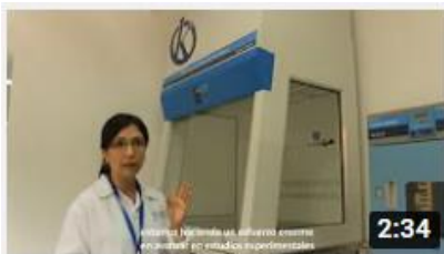
Kalstein France - Jacinto Convit Foundation / Alliances